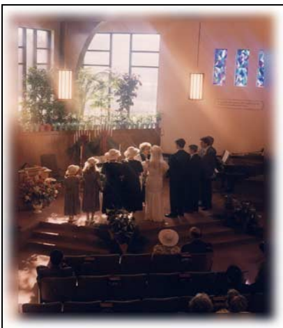
Akron Area Places of Worship

Akron Beacon Journal , the Barberton Herald , Leader Publications the Post Newspaper the Plain Dealer , Record Publishing , the Akron News Reporter , Richfield Times , Hudson Life & Bath Journal , the Suburbanite